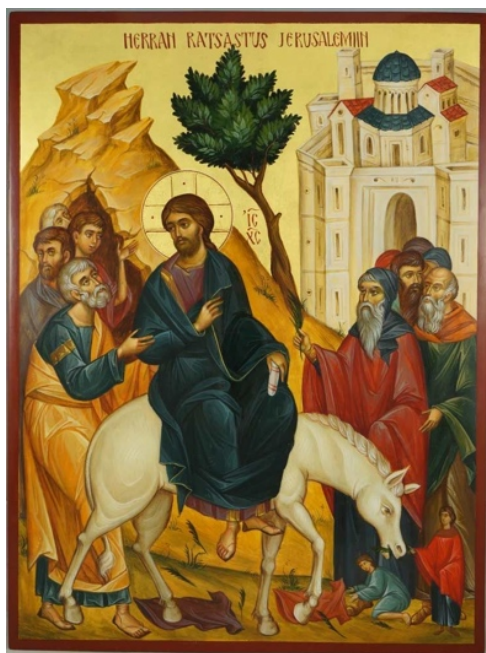
Entry into Jerusalem